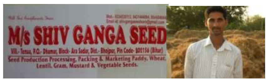
Details of Company with Address