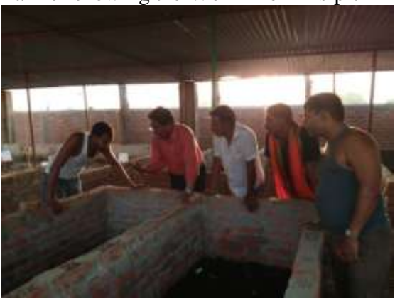
With farmers visit of unit