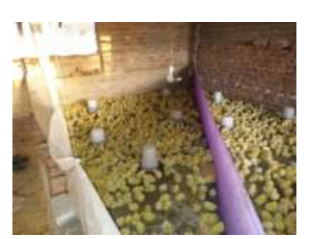
Three day Old Chicks