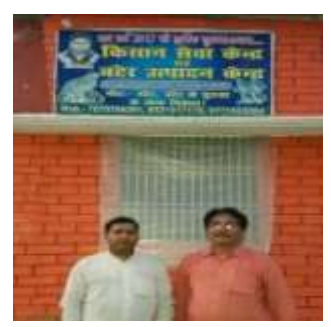
Famer with KVK, Bhojpur Head