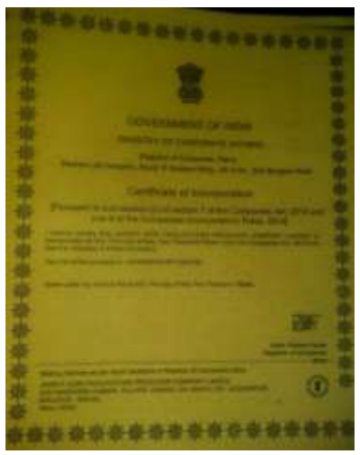
Registration certificate of FPO f